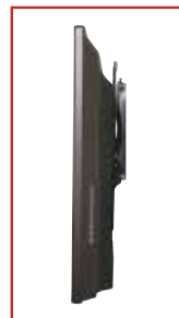
Low-profile design for a sleek, yet compact installation