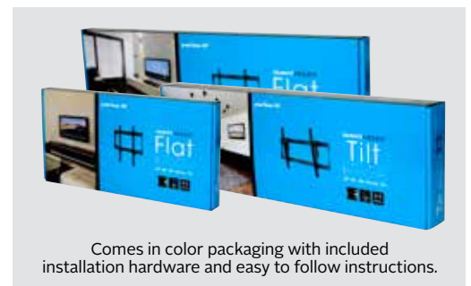
Comes in color packaging with included installation hardware and easy to follow instructions.